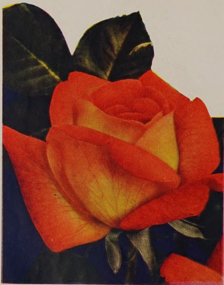
MARK SULLIVAN—$1.25 each; 3 for $3.15 (Plant Patent Applied for)

CALIFORNIA —Plant Pat. No. 449. The color is a glorious shade of ruddy orange toned with saffron yellow, with the exterior of the broad petals overlaid with Saturn rose—a dual tone effect of indescribable richness and beauty. Flowers of enormous size. $1.50 each, 3 for $3.75.